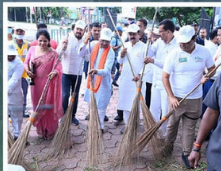
SHRI VISHNU DEO SAIV Chief Minister of Chhattisgarh