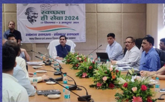
SHRI TOKHAN SAHU MoS, Ministry of Housing & Urban Affairs