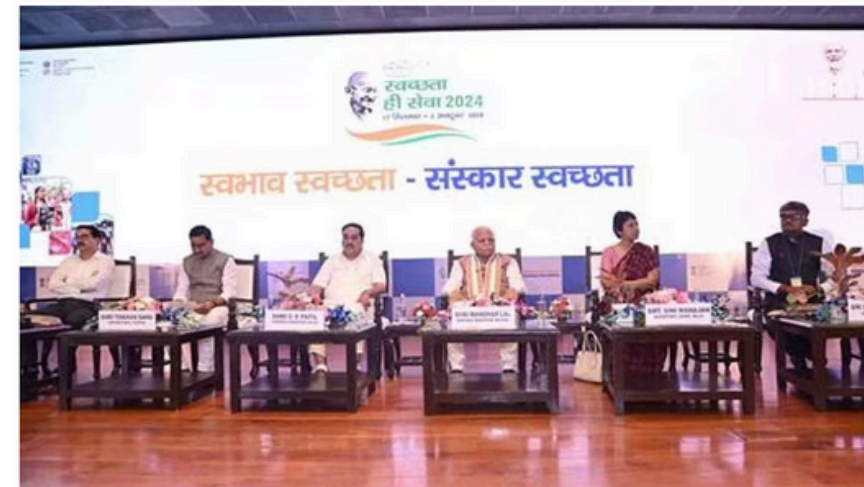
Under the 'Whole of Government' approach, the campaign will also see participation from all States, UTs, Chief Ministers, Central Ministers, local bodies and State Field Units (SFLUs), Members of Parliament

Follow Us : WhatsApp, Telegram, Facebook, YouTube