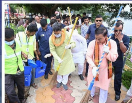
SHRI MANIK SAHA Chief minister of Tripura