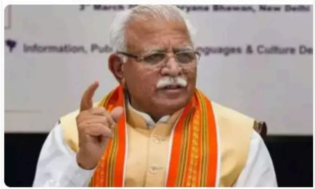
Manohar Lal Khattar (File photo)