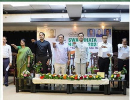
SHRI PRAMOD SAWANT Chief Minister of Goa