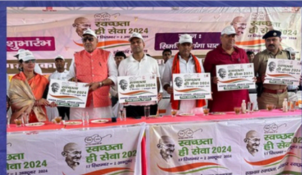
SHRI GIRIRAJ SINGH Ministry of Textiles