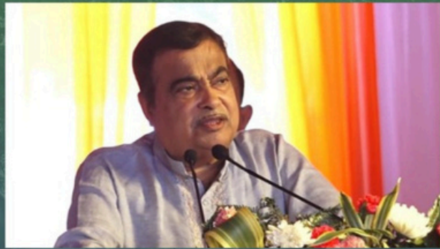
SHRI NITIN GADKARI Ministry of Road Transport & Highways