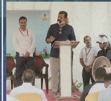
SHRI SURESH GOPI MoS, Ministry of Petroleum & Natural Gas