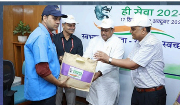
SHRI SUKANTA MAJUMDAR Ministry of Education