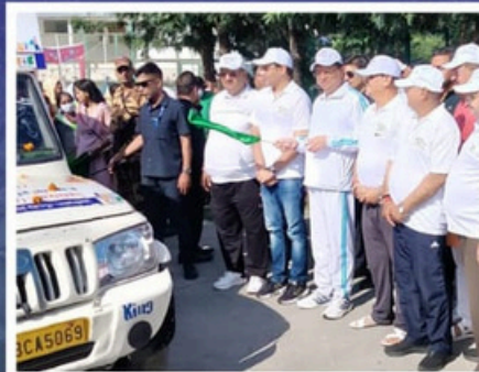
SHRI PUSHKAR SINGH DHAMI Chief minister of Uttarakhand