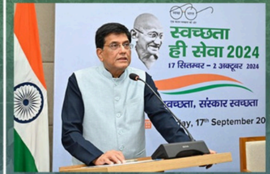
SHRI PIYUSH GOYAL Ministry of Commerce & Industry