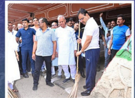
SHRI BHAJAN LAL SHARMA Chief Minister of Rajasthan