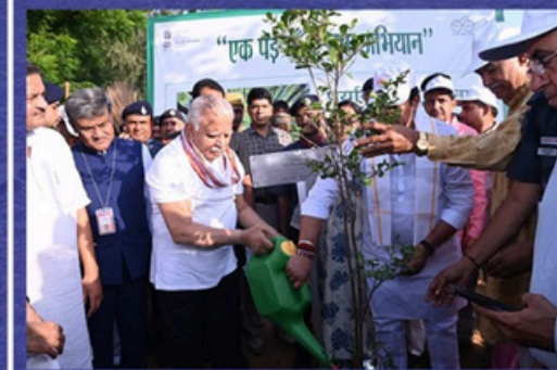
SHRI MANOHAR LAL Ministry of Housing & Urban Affairs