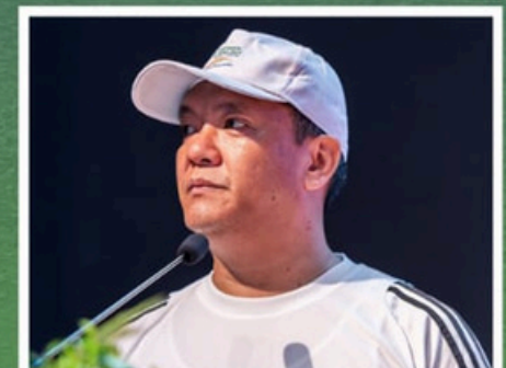
SHRI PEMA KHANDU Chief minister of Arunachal pradesh