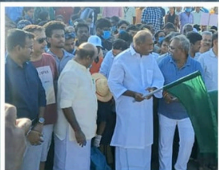
SHRI N. RANGASWAMY Chief minister of Puducherry