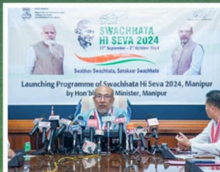
SHRI N. BIREN SINGH Chief Minister of Manipur