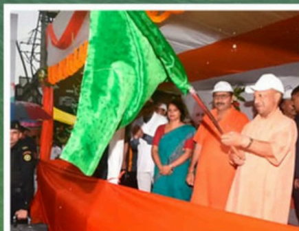
SHRI YOGI ADITYANATH Chief Minister of Uttar Pradesh