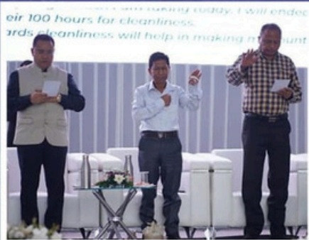
SHRI SNIAWBHA DHAR Deputy Chief Minister of Meghalaya