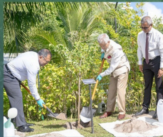
SHRI S JAISHANKAR Ministry of External Affairs