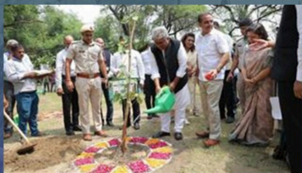
SHRI BHUPINDER YADAV Ministry of Environment, Forest & Climate Change