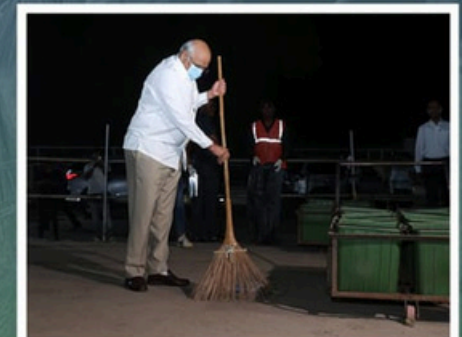
SHRI BHUPENDRABHAI PATEL Chief Minister of Gujarat