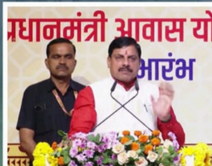
SHRI MOHAN YADAV Chief Minister of Madhya Pradesh