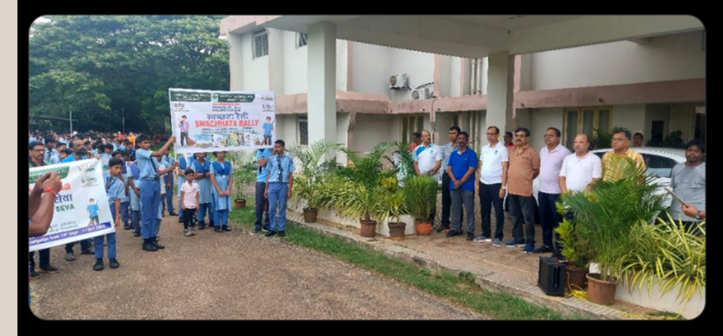
11:22 pm · 24 Sep 2024 · 178 Views

Over 300 enthusiastic schoolchildren joined the Swachhata Rally at #RINL, spreading the message of cleanliness and hygiene across Ukkunagaram. #SwachhataHiSeva2024 @hd_kumaraswamy @BjpVarma @SteelMinIndia @PibSteel @PTI_News @PMOIndia @PIB India @AndhraPradeshCM @MIB India