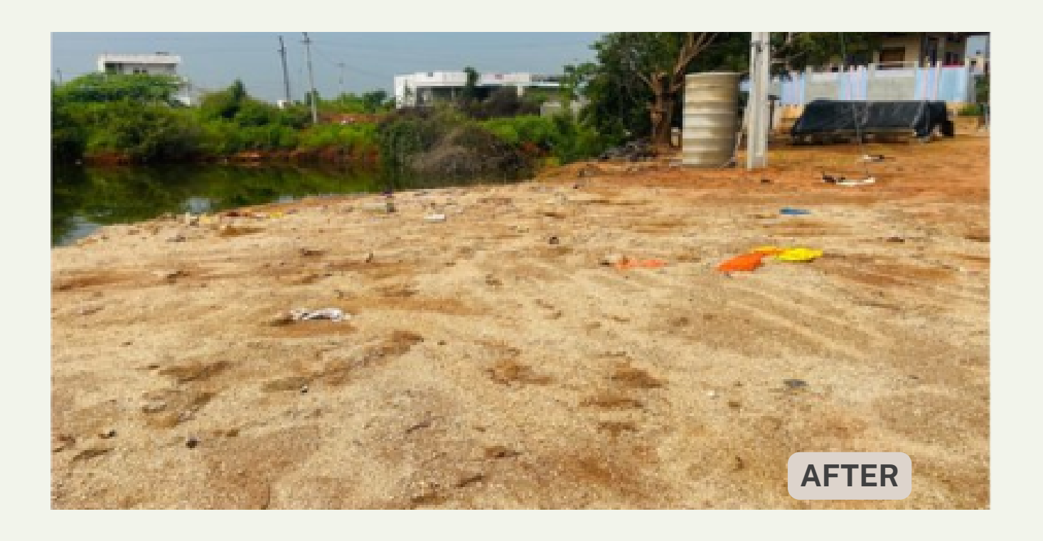
Kalwakurthy Municipality, Telangana