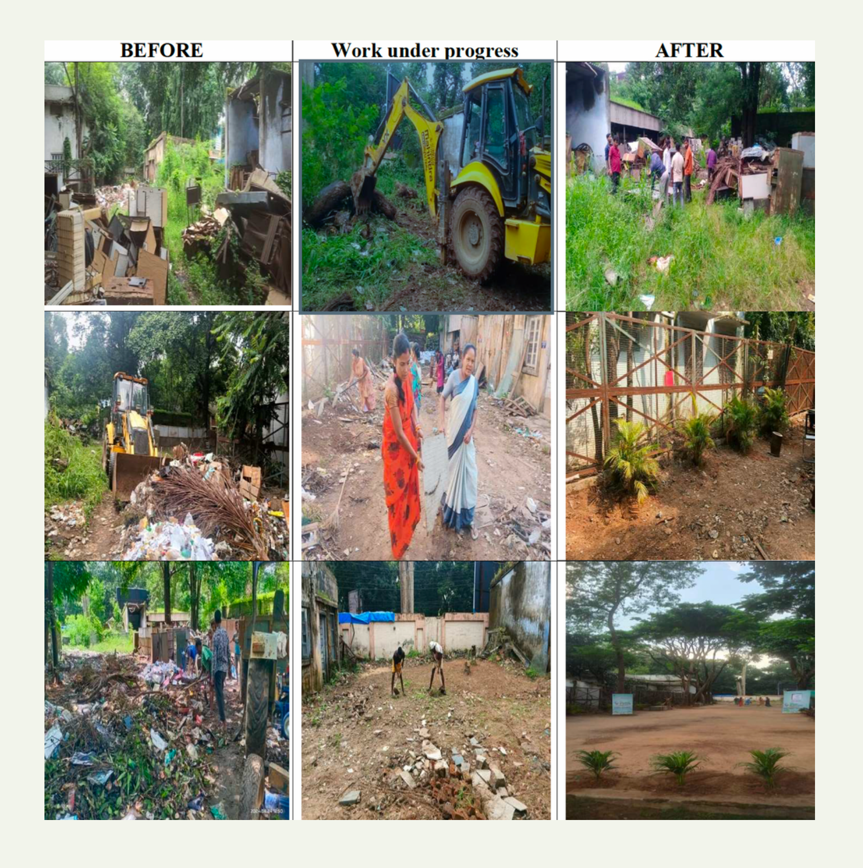
MECON Ltd. Head Office, Ranchi, Jharkhand