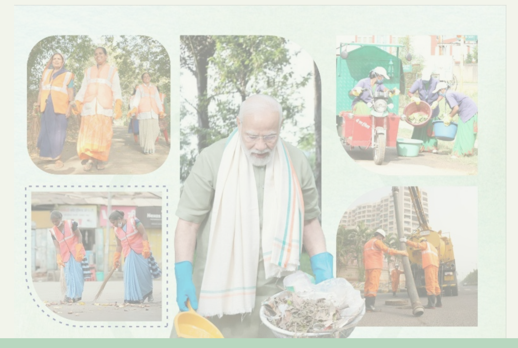
25 September '24 Day 9 Swabhav Swachhata - Sanskaar Swachhata Bulletin Swachhata Hi Seva 2024