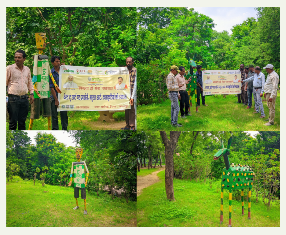
Events shown (clockwise order): Waste-to-art initiatives from the Jabalpur municipality