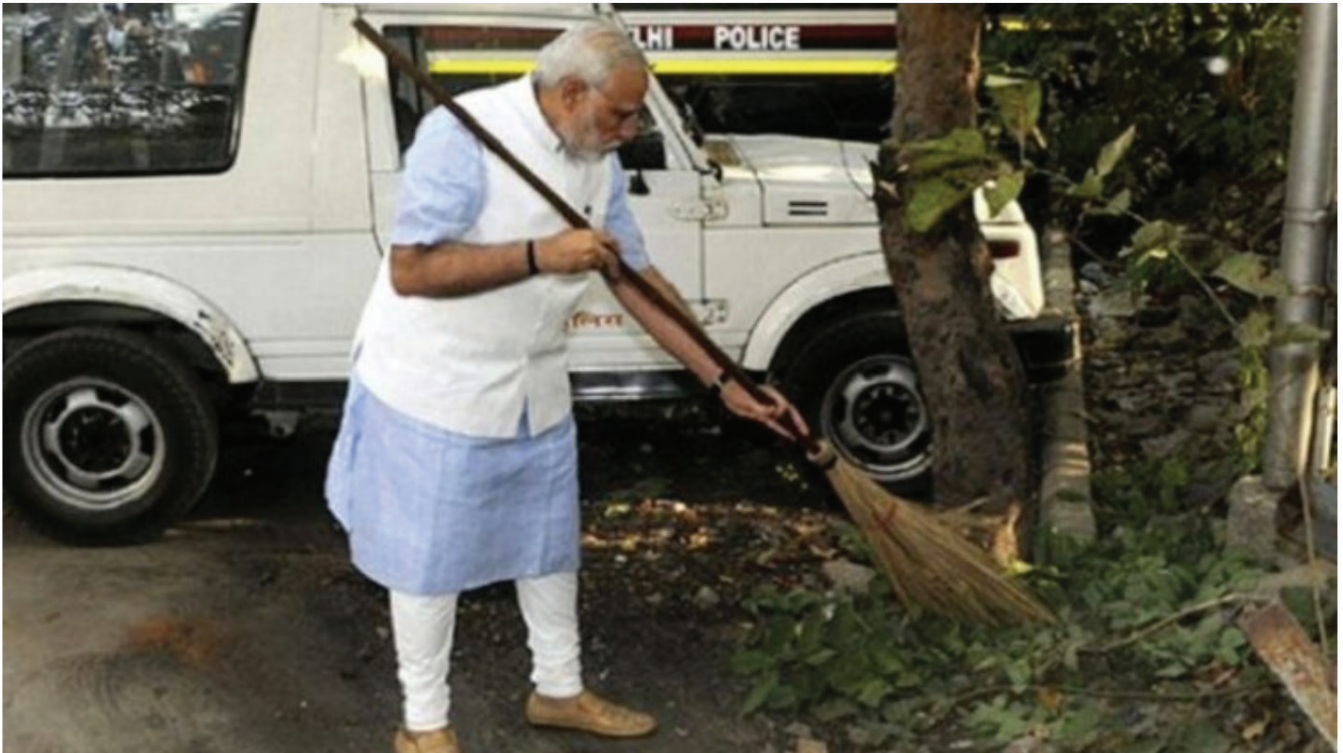
3rd quarter (Q3) of 9th edition of Swachh Survekshan 2024 launched

https://globalgreennews.com/2024/06/27/9th-edition-q3-of-swachh-survekshan-2024-launched/