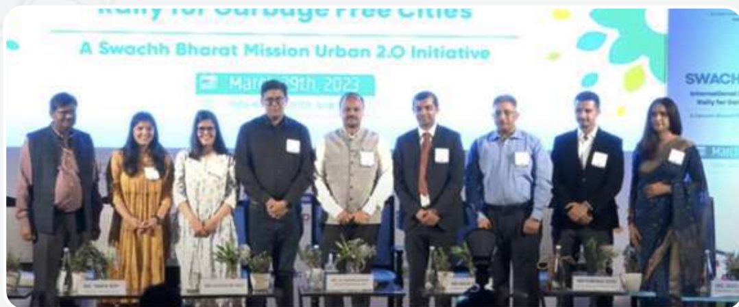
Third Panel discussion highlighted on 'Business and Tech for Garbage Free Cities