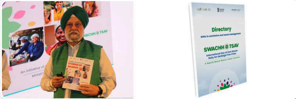
The 'Story of Change' compendium and the Women SHG directory, showcasing the inspirational journey of Women-Led Sanitation, launched by the Union Minister.