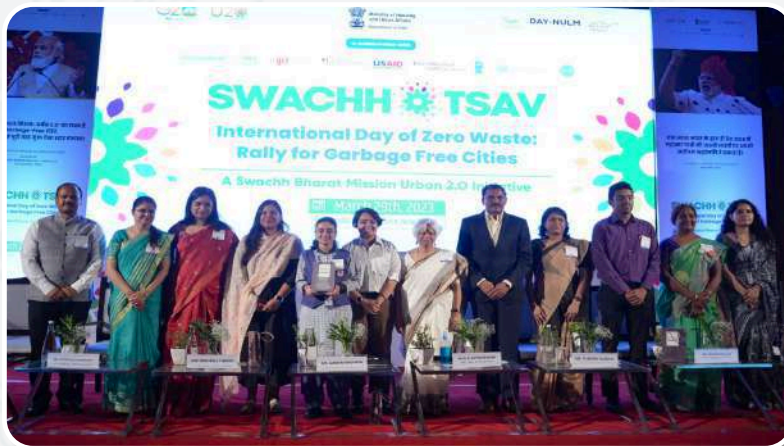
Second panel discussion on 'Women and Youth for GFC'.