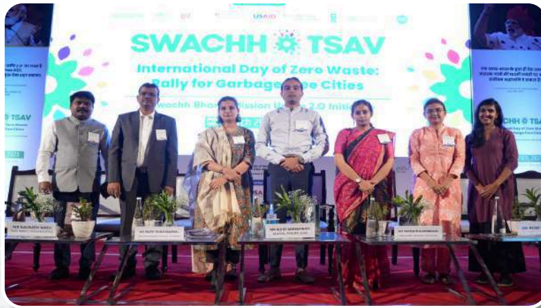
On the International Day of Zero Waste, the first Panel discussions focused on 'Circularity in Garbage Free Cities,