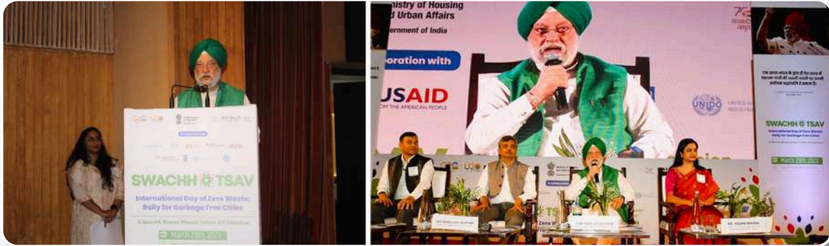
Union Minister Shri Hardeep Singh Puri praised the Rally for Garbage Free Cities as women-led Jan Andola, during his keynote address at the International Day of Zero Waste event.

The event was attended by Mayors, Commissioners, State Mission Directors of SBM-U 2.0 and DAY-NULM, city government officials, Swachhata Doots from Swachhata Yatra, Master Trainers of GFC Influencers' Network, civil society organizations, academicians, and development partners.