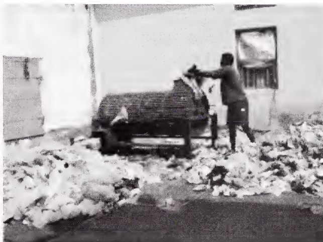
Fig. 2 Cleaning Process

Waste plastic litter in the form of thin-film carry-bags, use-and-throw cups, PET bottles, etc. these are sorted, de-dusted, washed if necessary.