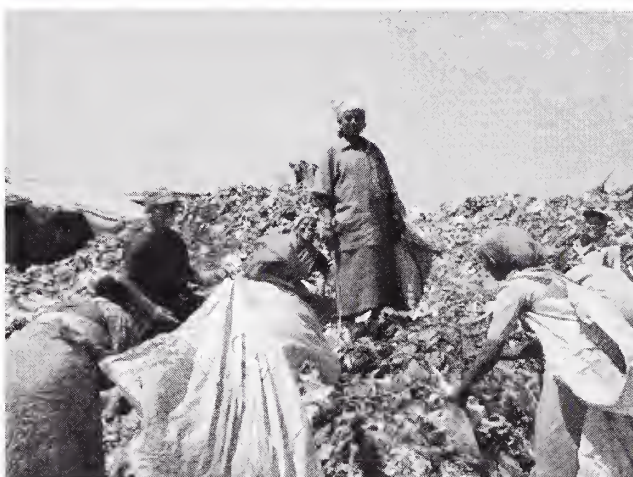
Fig. 1 Collection of Waste Plastic

Waste plastic is collected from roads, garbage trucks, dumpsites or compost plants, or from school collection programmes, or by purchase from rag-pickers or waste-buyers