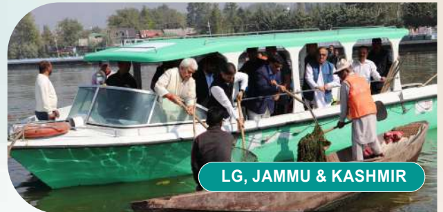
LG, JAMMU & KASHMIR