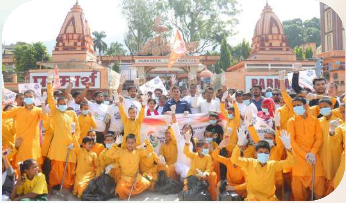
Parmarth Niketan's team joined hands with Pauri Garhwal district and offered shramdaan for Ganga ghat cleanup.