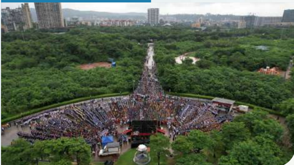
Nearly 1.5 lakh Mumbaikars participated in a massive rally