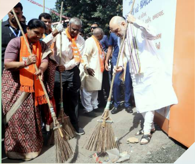
Union Home Minister Amit Shah participates in the 'Shramdaan for cleanliness' program under the 'Swachhata Hi Seva' campaign in Ahmedabad.

Various organizations under the Central Government ministries came forward with unique activities. Union ministers joined the shramdaan at various sites too. The 'whole of govt approach' resulted in smooth facilitation for the shramdaan volunteers at lakhs of sites at the same time.