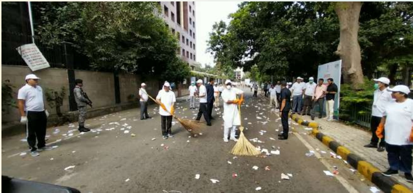
Ministry of Power