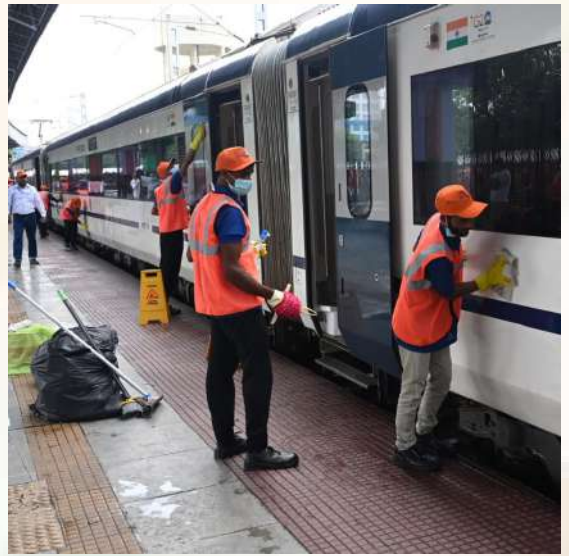
Ministry of Railways