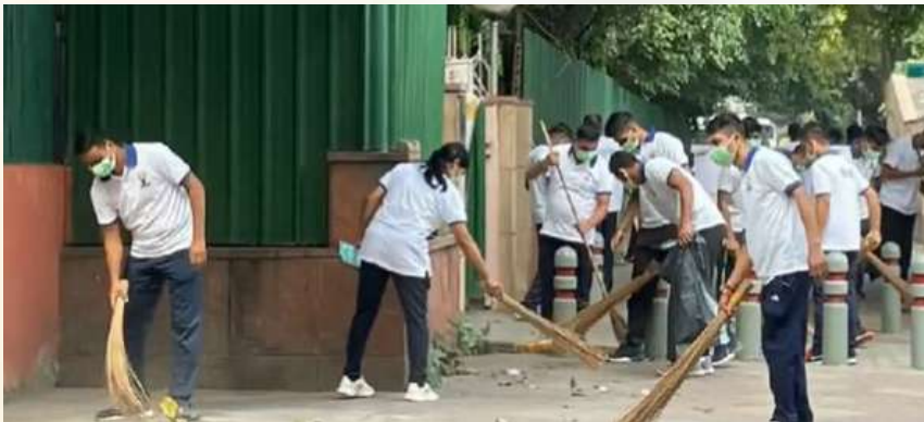
Ministry of Ayush