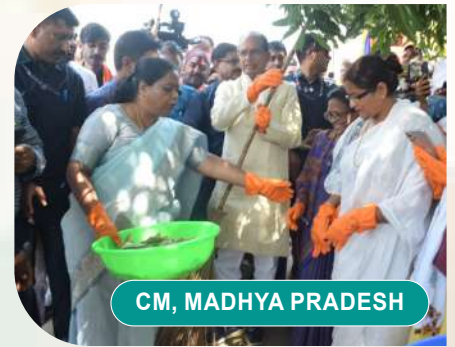
CM, MADHYA PRADESH