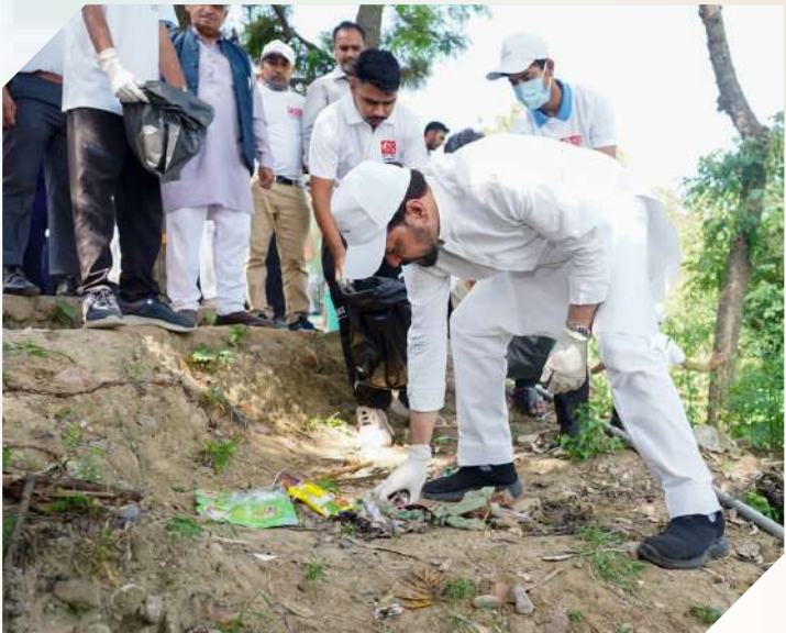
Youth Affairs and Sports Minister Anurag Thakur participated in shramdaan for Swachhata at Himachal Pradesh's Hamirpur.