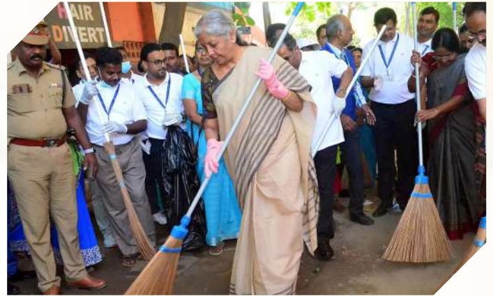
In support of Shramdaan for Swachhata, Finance Minister Nirmala Sitharaman participated in a cleanliness campaign in Coimbatore.