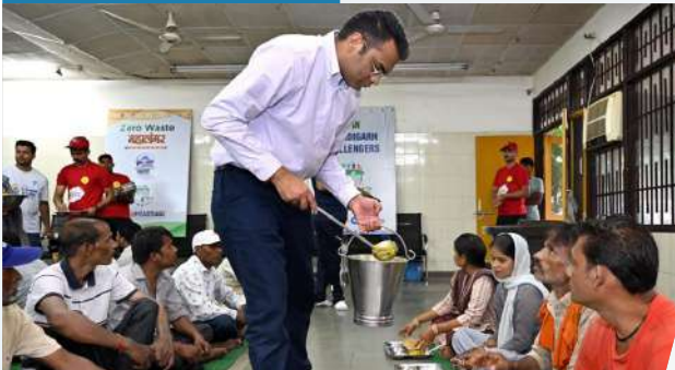
Zero Waste Mahalangaar arranged for 10,000 people