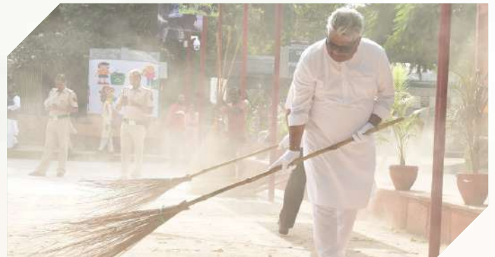
Environment Minister Bhupender Yadav participated in a cleanliness drive at the Delhi Zoo, as a part of the Swachhata Hi Seva campaign.