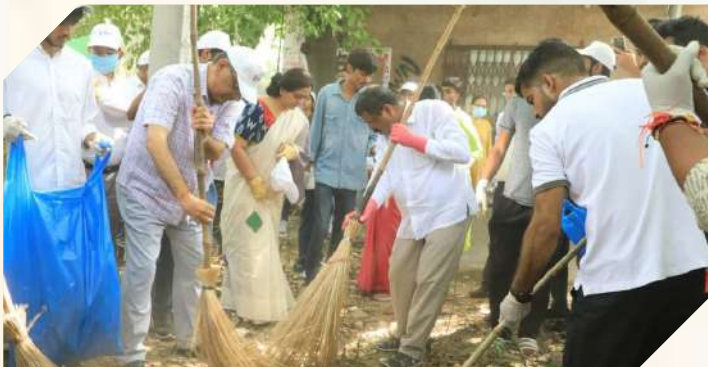
Education Minister Dharmendra Pradhan teamed up with students in a cleanliness initiative at Delhi University.