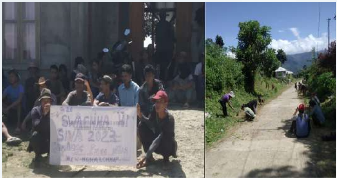
Mizoram's village community cleans garbage-vulnerable sites