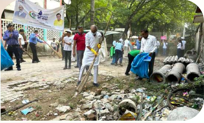
Sulabh International participated in shramdaan with cleanliness events across 1,000 locations in 300 Towns involving over 50,000 citizens.