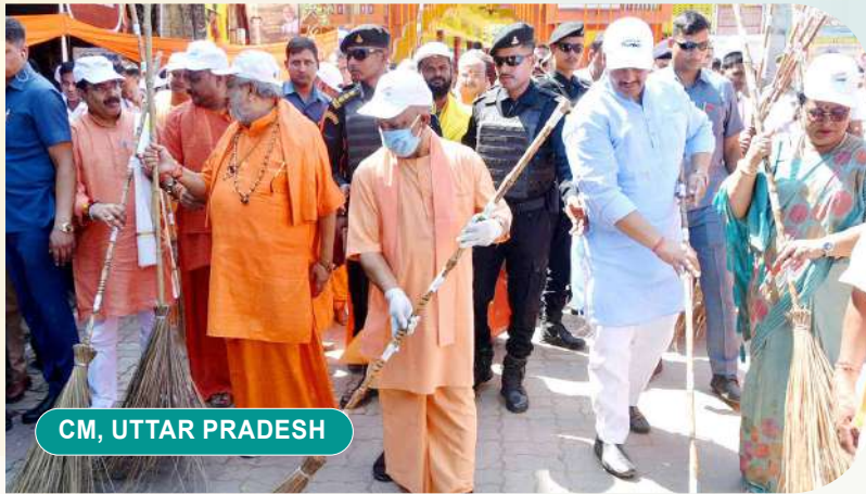
CM, UTTAR PRADESH