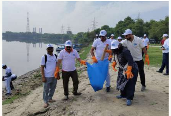
Ministry of Jal Shakti