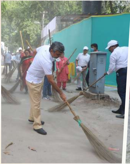
Ministry of Housing and Urban Affairs