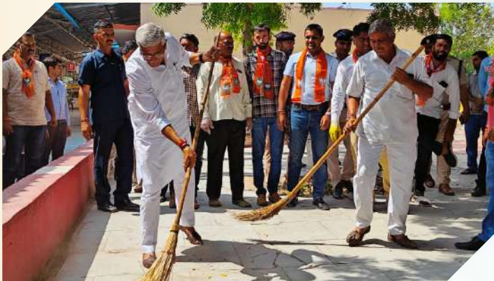
During Swachhata Pakhwada, Jal Shakti Minister Gajendra Singh Shekhawat led a one-hour Swachhata shramdaan at Jodhpur's Raika Bagh station.