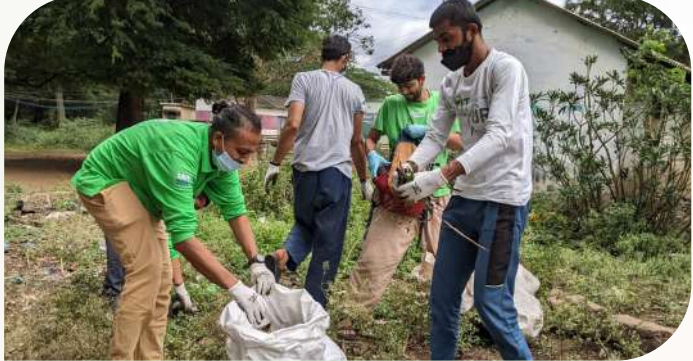
Under the Swachhata hi Seva campaign, Isha Yoga Center's volunteers conducted a cleanup drive in the nearby villages of the Coimbatore Ashram.