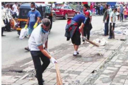
In a recent episode of "Mann Ki Baat," Modi appealed for "one hour of shramdaan for swachhata" on October 1, which would be a tribute to Mahatma Gandhi in the run-up to Swachh Bharat Diwas on October 2, 2023. The Ministry of Housing and Urban Affairs (MoHA) and the Department of Drinking Water and Sanitation, Ministry of Jal Shakti, launched the 'Swachhata Hi Seva' for eight days from September 16 which will conclude today on October 2. In collaboration with other ministries, to celebrate nine years of the Swachh Bharat Mission.

People from various backgrounds, including politicians and students, participated in an hour-long 'shramdaan' on Sunday in response to Prime Minister Narendra Modi's call for a nationwide cleanliness drive in Pune and Pimpri-Chinchwad.