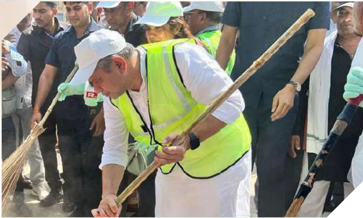
Railway Minister Ashwini Vaishnaw led the cleanliness drive for Swachhata Hi Seva campaign at Gurgaon Railway Station.