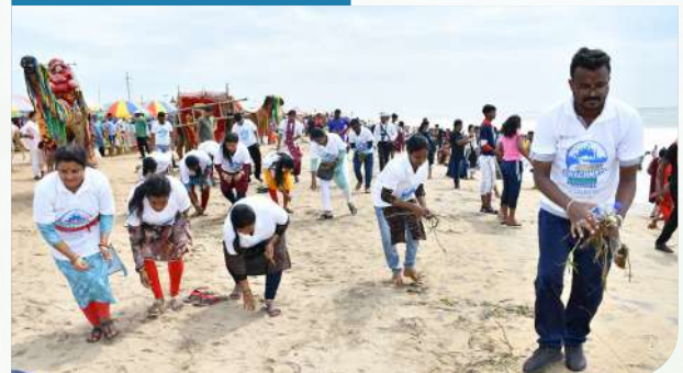
Massive plogging campaign by women and street vendors