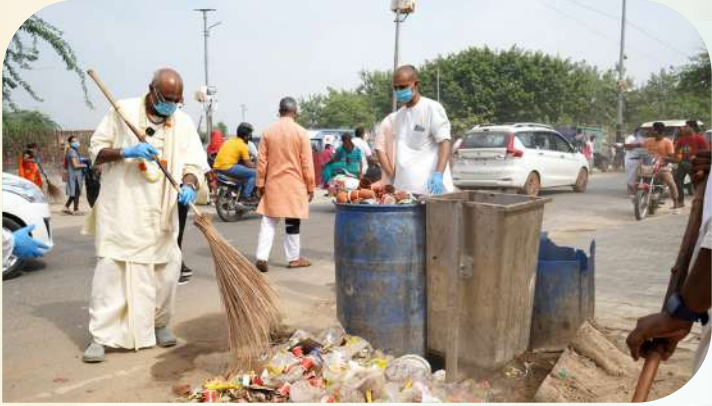
Devotees from Vrindavan Chandrodaya Mandir under ISKCON contributed to swachhata shramdaan at Braj Dham in Vrindavan.