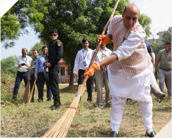
Raksha Mantri Shri Rajnath Singh led the shramdaan activities at Delhi Cantt with a cleanliness drive followed by a plantation drive.