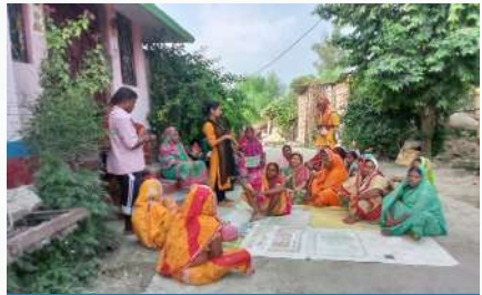
Jeevika didis raise awareness on sanitation in rural Bihar