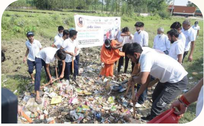
Patanjali Yogpeeth along with 30,000 citizens cleaned highways, parks in residential areas where they do yoga and gaushalas.