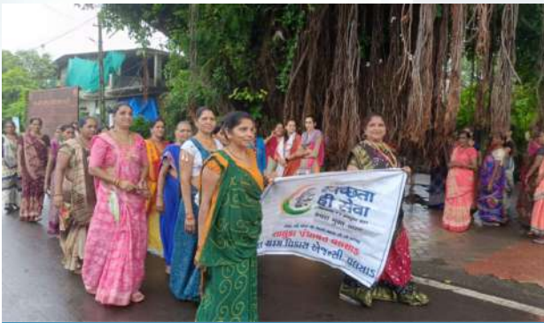
SHGs come forward for Shramdaan in Gujarat villages

Demonstrating its commitment to cleanliness and environmental preservation, Department of Drinking Water & Sanitation (DDWS) co-launched the Swachhata Pakhwada - Swachhata Hi Seva 2023. Massive cleanliness drives were conducted in the Gram Panchayat under the aegis of DDWS. College students, government officials, village members and self-help groups participated enthusiastically, pledging their commitment to the cause. Sarpanches pledged to transform Panchayats into a model of cleanliness and a garbage-free haven. From vibrant villages along Arunachal Pradesh border to villages in the hills of Uttarakhand, the Gram Panchayats witnessed mass mobilization for swachhata