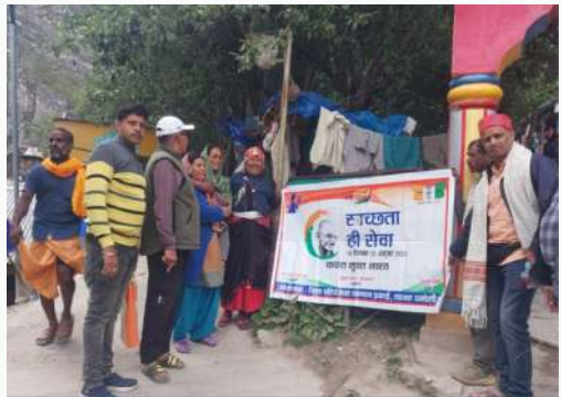
Clean up drive in Uttarakhand's Vibrant Village Mana