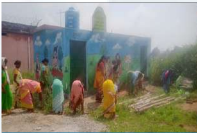
Gram Panchayats join hands to make Jharkhand's Latehar litter free