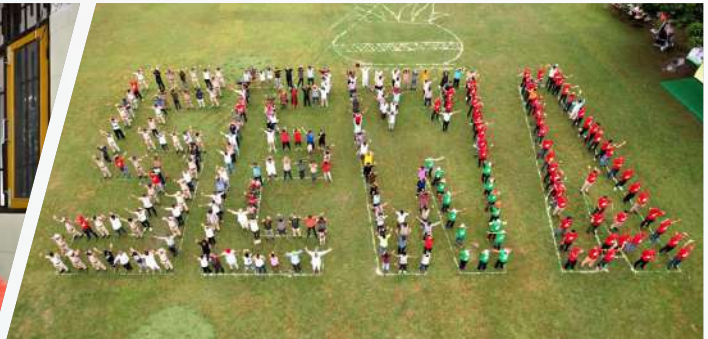
Giving the message of Swachhata Hi Sewa, Team Chandigarh form a human chain SEWA