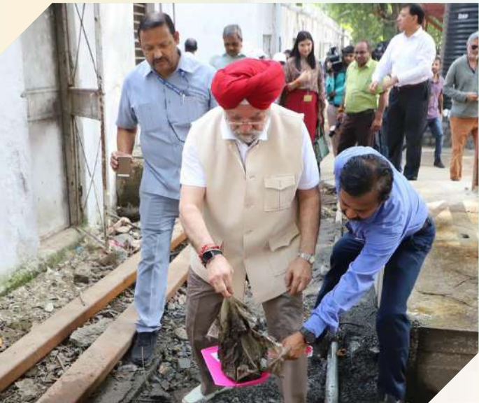
Union Minister Hardeep Singh Puri joined residents of Princess Park on Copernicus Marg in Delhi for one hour of Shramdaan for Garbage