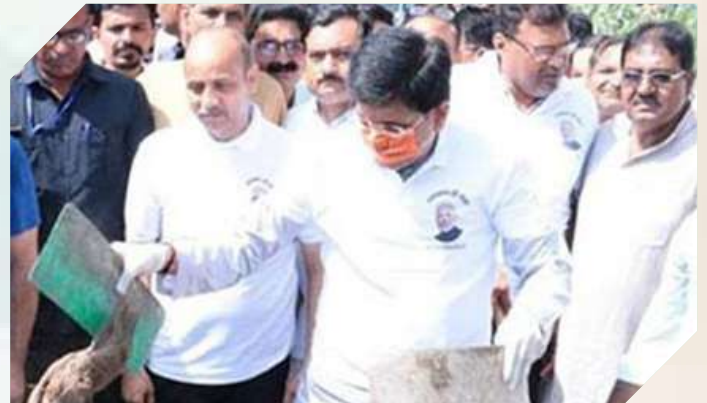
Union Minister Piyush Goyal performed his Shramdaan for Swachhata in Kota, Rajasthan as part of the nationwide campaign.