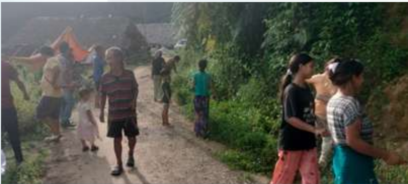
Shramdaan in villages along the India-China border of Arunachal Pradesh