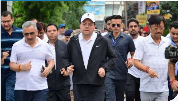
Uttarakhand CM Pushkar Singh Dhami joined Run For Green and Clean Doon marathon