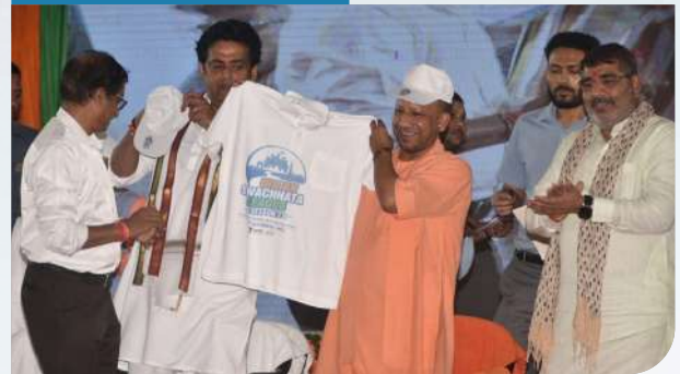
Uttar Pradesh CM Shri Yogi Adityanath honoured sanitation workers with ISL 2.0 merchandise