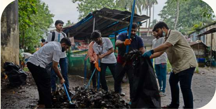
Devotees of Mata Amritanandamayi come together to contribute through shramdaan within the Ashram premises.