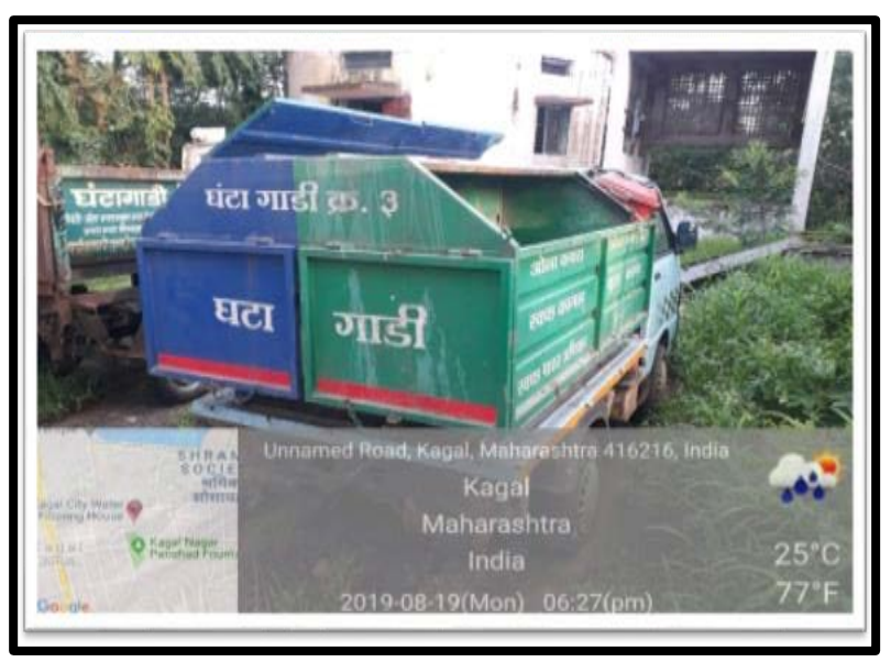
D2D Collection Vehicle